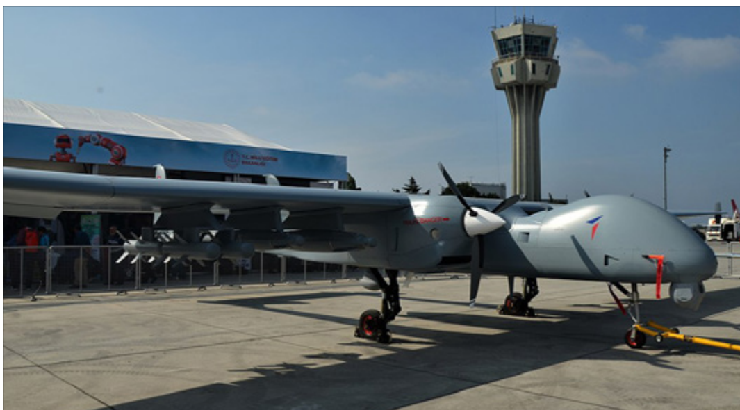
TAI Aksungur at Teknofest 2019.

M orocco issued a warning to Iran, which is accused of militarily supporting separatist and terrorist groups