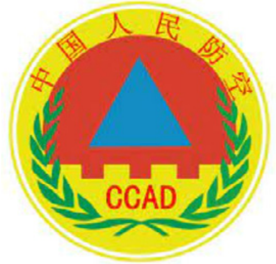
Emblem of the Chinese People's Civil Air Defense

The exercise was primarily focused on three phases: preparations made before air attacks, including using camouflage and moving critical facilities into underground spaces; how to respond during an air raid, such as using obscurants and aerial barriers (balloons or wires to interfere with low-flying aircraft); and post-strike operations, which involves repairs and emergency response. The exercise also highlighted how newer technologies, such as quadcopters, are being adapted in practical ways to support operations. Accompanying images in the article showed quadcopter drones being used to deliver medical supplies. The report indicated that these drones could carry 10kg (22 pounds) over 10km (6.2 miles). UAVs are regarded as an optimal delivery system as they would not be limited by traffic in a dense urban environment during a crisis.