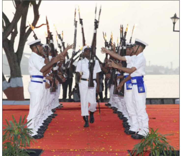
India Navy continuity drill.