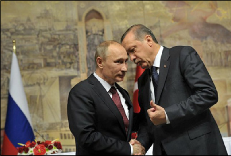
Putin with Erdoğan.