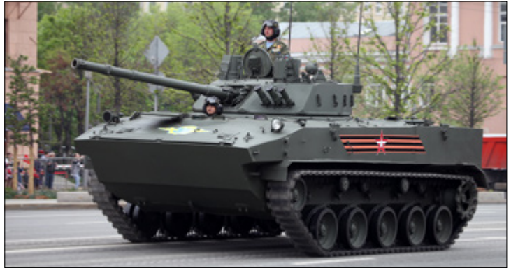
Combat Vehicle of the Airborne BMD-4M

The accompanying excerpted article from a Russian military enthusiast website, Voyennoye Obozreniye (notably still allowed to remain active), features a Russian military watcher's assessment of issues concerning, and possible reforms of, the Russian Airborne Troops (VDV). As some of his chief concerns, the author highlights insufficient armor, artillery, air defenses, and airlift capabilities for the VDV. He also posits that the requirement of air supremacy for parachute landings and the hazards of the proliferation of air defense systems make parachute landings unfeasible. Although the author questions current VDV equipment and doctrine, he seems confident the overall VDV concept is sound and may just need to be updated.