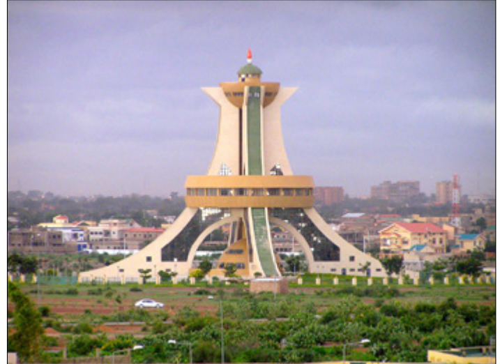
Memorial of the Martyrs in Ouagadougou, Burkina Faso.

As the interview details, Traoré, a longtime supporter of Russia, views Russian support positively and pragmatically. Given the dire situation that the country faces, Traoré believes Russia to be the country's only option, especially