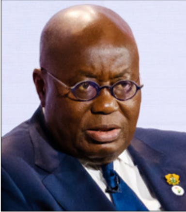
President of Ghana, Nana Addo Dankwa Akufo-Addo.