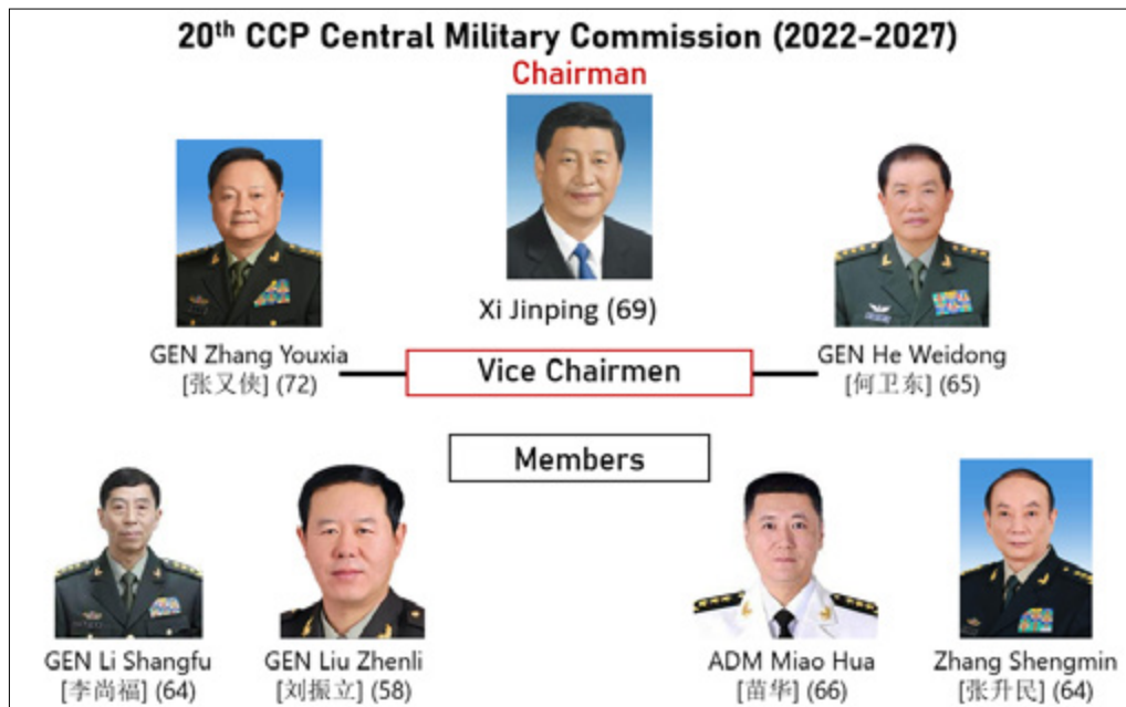
20th CCP Central Military Commission (2022-2027)

continued emphasis on the speedy transformation of the PLA, seen since Xi first took the reins of the CCP in 2012 at the 18th Party Congress.