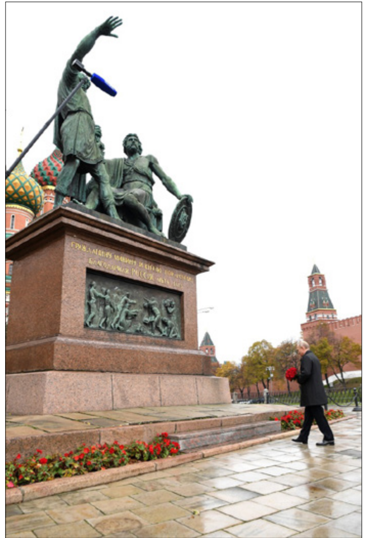
Vladimir Putin laid flowers at the monument to Kuzma Minin and Dmitry Pozharsky on Red Square, 4 November 2020

The focus of the course on the formation of Russian patriotism is ensured by priority attention to the heroic pages of Russia’s struggle for freedom and independence against foreign invaders, for ensuring national interests and security.