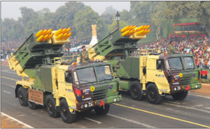
Pinaka MBRL at rehearsal of Republic Day Parade 2011.