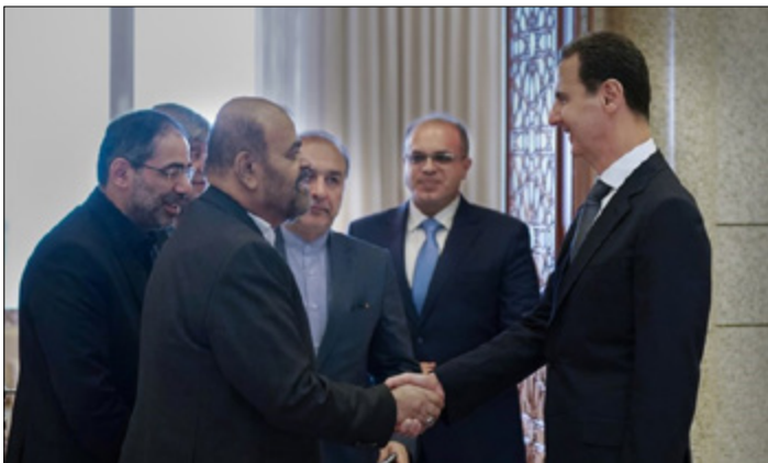
Iranian Minister of Roads and Urban Development Rostam Ghasemi meets with Syrian President Bashar al-Assad, October 7, 2022 in Damascus, Syria

Iran stands by the people and government of Syria.