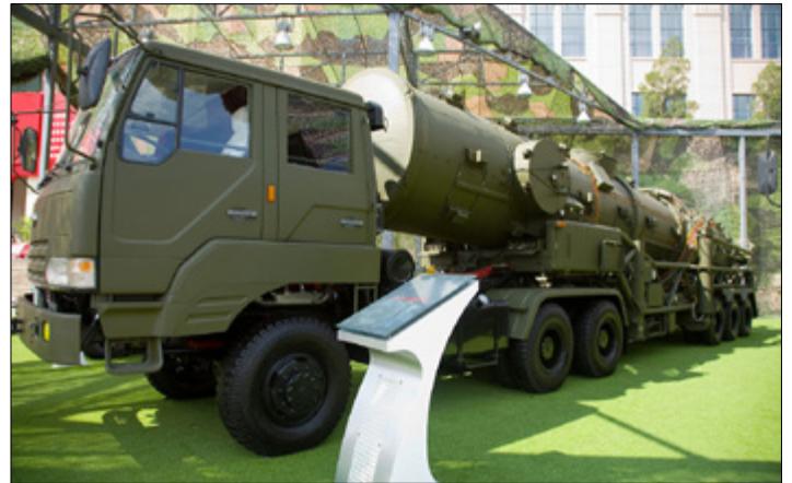
A Chinese DF-21A transporter erector vehicle on display at the "Our troops towards the sky" exhibition at the Beijing Military Museum.

In contrast to the clandestine missile program, Saudi-Chinese cooperation on UAVs and counter-UAV systems is mostly in the open. In the past decade, Saudi Arabia has purchased the Chengdu Aircraft Industry Group's Wing Loong II and the China Aerospace Science and Technology Corporation's Rainbow CH-4 UAVs, employing them in the Yemen conflict and signing cooperation agreements for CH-4s to be coproduced in Saudi territory. Saudi military industry has also contracted with the China Electronics