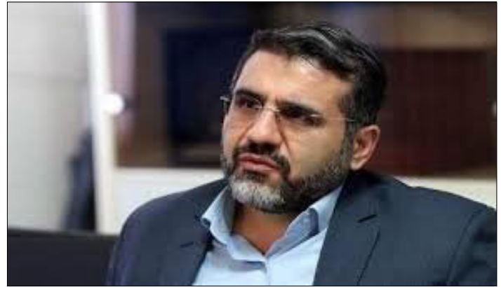
Mohammad-Mehdi Esmaeili, minister of culture and Islamic guidance

Looming in the background to his remarks, but unmentioned by Esmaeili himself, are both Iran's history of sep-