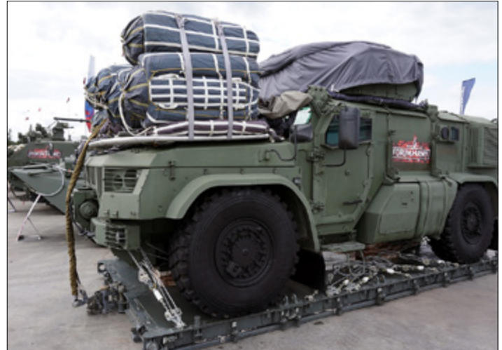
KAMAZ-4386 Typhoon-VDV rigged for air drop

The accompanying excerpted article from the pro-Kremlin daily newspaper Izvestiya discusses Russian plans to establish the Russian Airborne Troops' (VDV) first material-technical support (MTO) brigade. Currently, MTO brigades are only found in the Russian Ground Forces' Combined Arms Armies and one Tank Army. According to the Izvestiya article, VDV operations in Syria, Kazakhstan, and presumably in Ukraine, have shown that the VDV requires a dedicated logistics formation ( soyedineniye ) to support the VDV's unique needs for not only long-term combat operations and/or deployment abroad, but also peacekeeping operations.