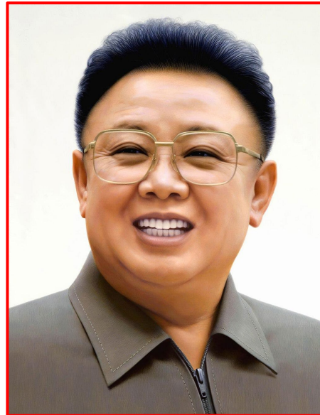
KIM Jong Il

Regime Founder, Great Leader , and “Eternal President”