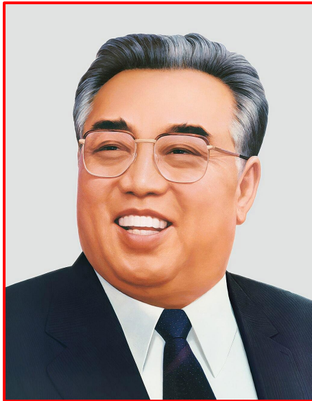
KIM Il Sung

North Korea has arguably the most pronounced, invasive, omnipresent, and effective cult of personality in history. The DPRK is effectively an absolute hereditary monarchy dressed in the trappings of communism. The leaders are human, yet divinely inspired. Infallible, but capable of receiving bad advice.