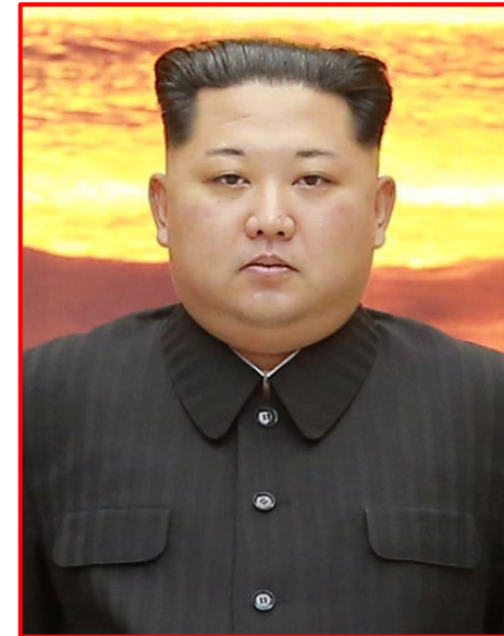
KIM Jong Un

The Dear Leader and “Eternal General Secretary”