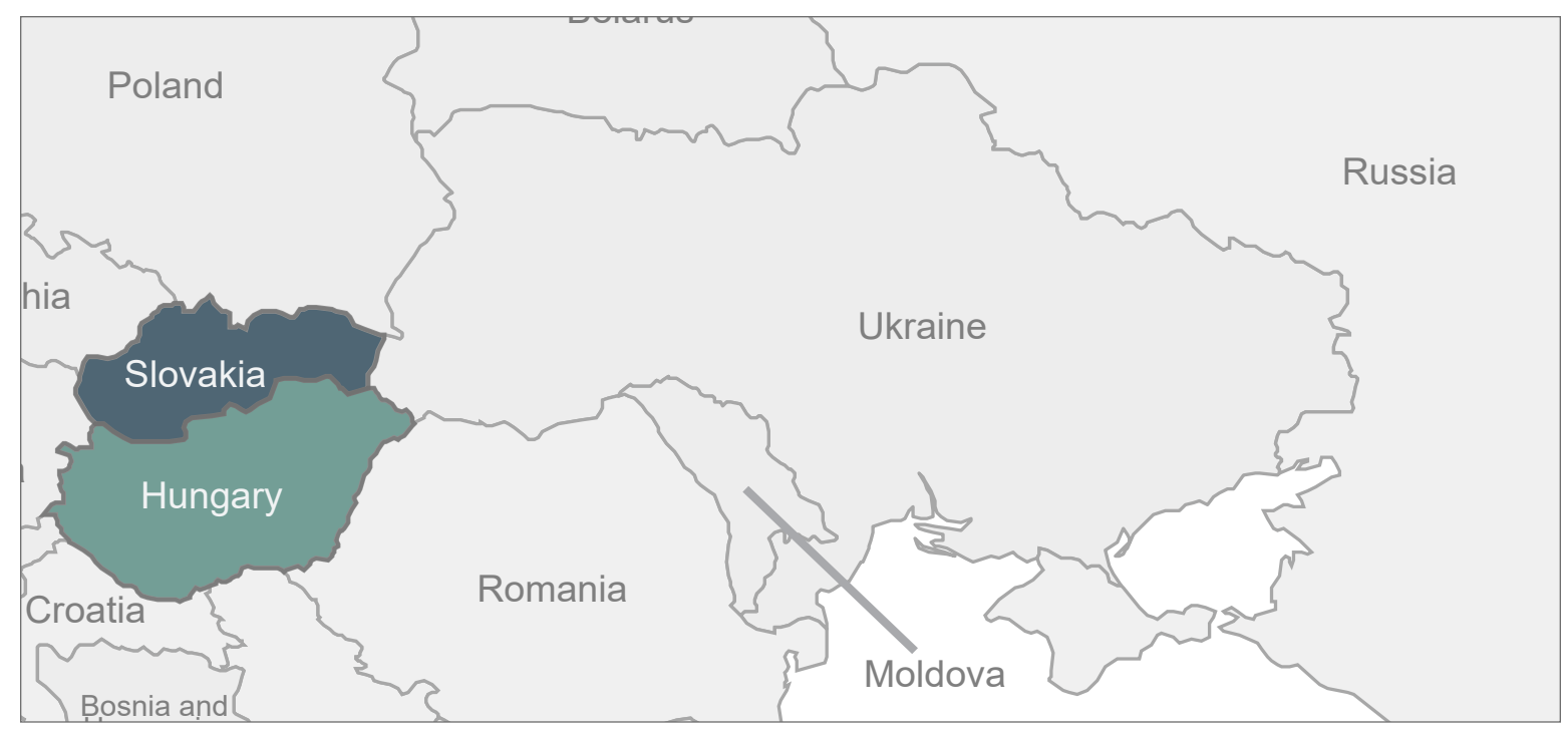
Figure 2. Hungary and Slovakia Map, GCKN.